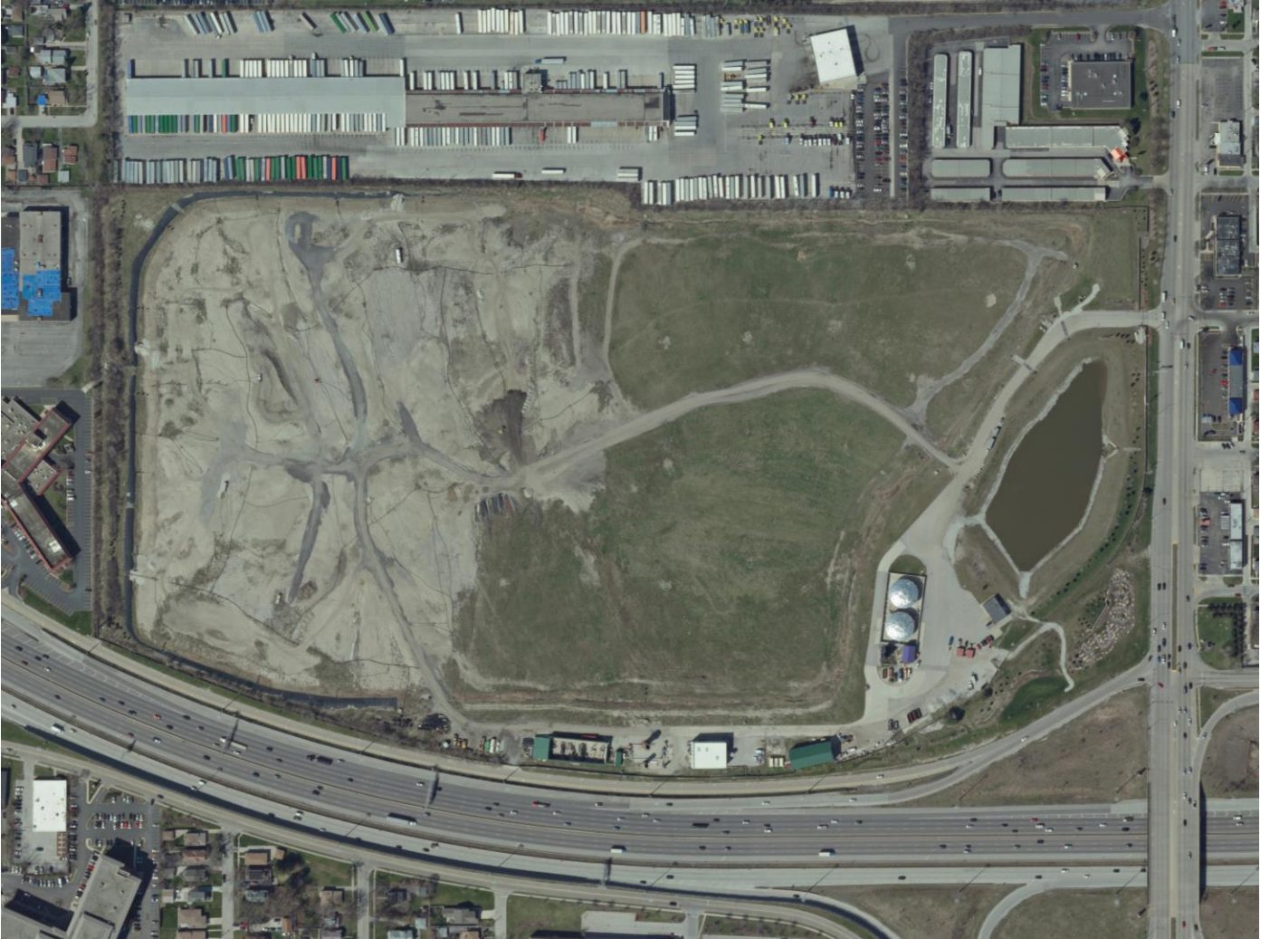
Aerial photograph taken April 12, 2016